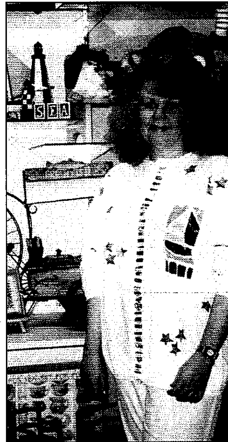
STONE'S THROW SHOP

Make Stone's Throw Shops a part of your next visit.